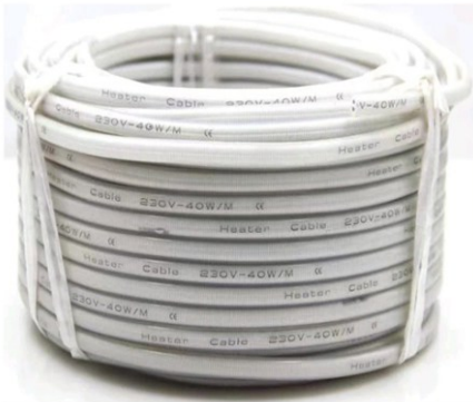
Silicone Parallel Circuit ( Cutt to Length Type)