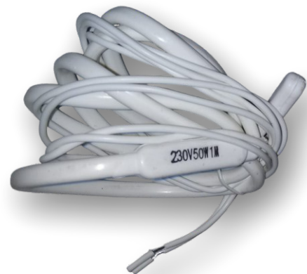
Silicone Drain Heater