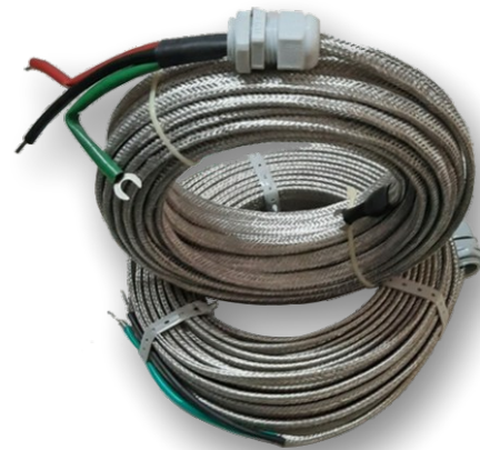
SS Drain Heater